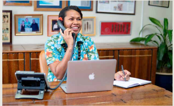
24-Hour Customer Care