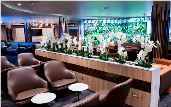
24-Hour Airport Services