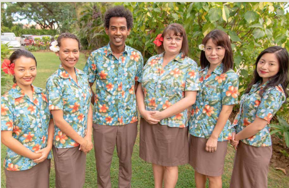
Foreign Language Concierge